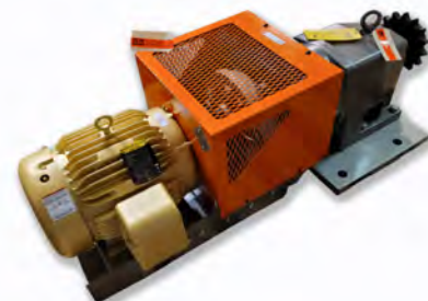
Reversed Engineered - Clinker Grinder Drive for a Customer's Obsolete Assembly

Reverse engineering is not a standard service offered by most distributors. Customers rarely need reverse engineering services until working obsolete equipment fails and replacement parts are no longer available. CDWdrives is one of the few industrial product distributors offering customers this service.